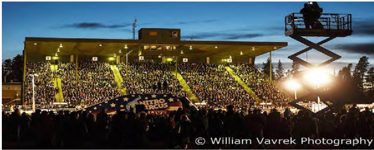
Nitro Circus at Evergreen was the largest attended single event in the history of the Peace Country.