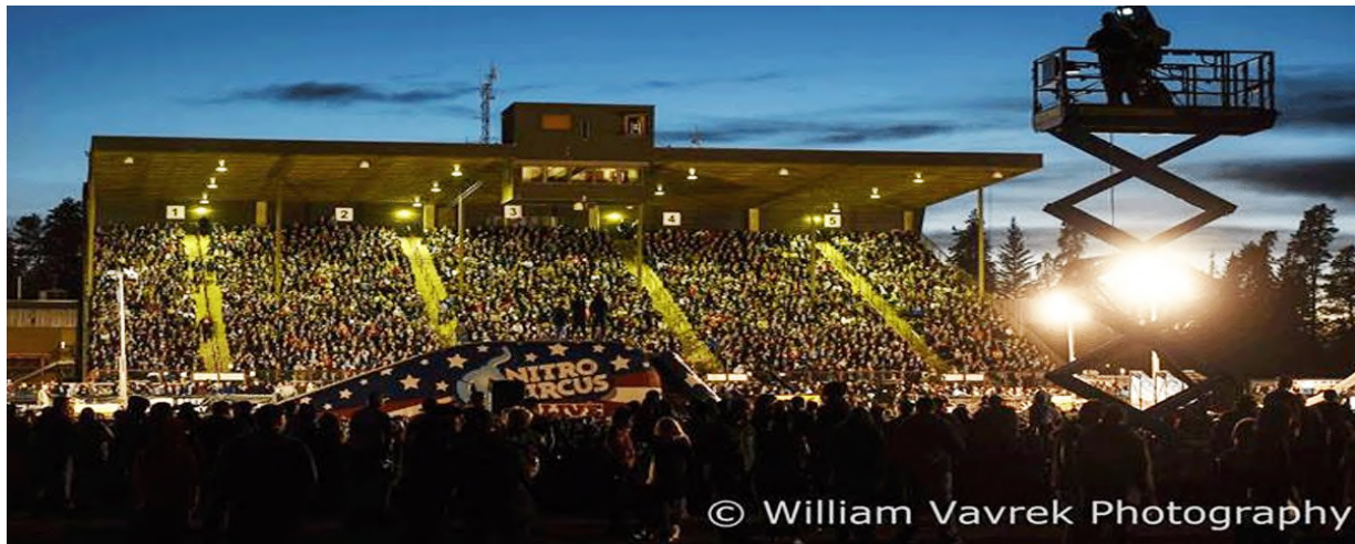
Nitro Circus at Evergreen was the largest attended single event in the history of the Peace Country.