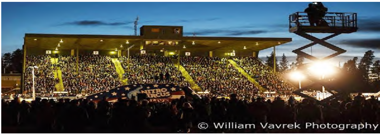
Nitro Circus at Evergreen was the largest attended single event in the history of the Peace Country.